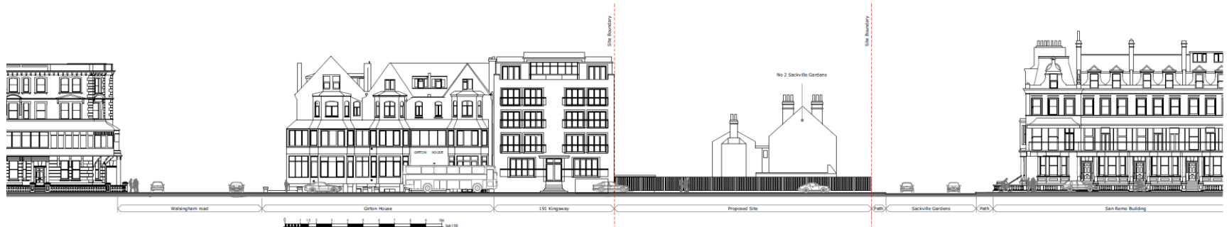
Existing Kingsway Street Elevation A-A (1:200)